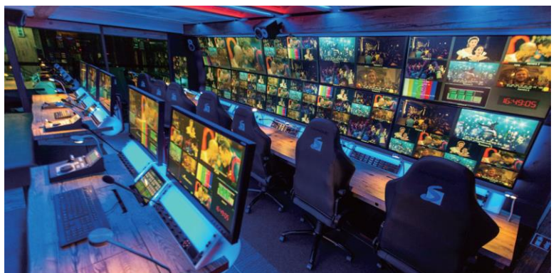
The interior of the Ü8 broadcasting van. Switches by Omada included.

To meet the high demands of 30 HD streaming workstations, a high-bandwidth data transmission system is essential for a reliable video broadcast. The two primary L3 switches, SG6428X, are interconnected via a trunk connection, enhancing data throughput between switches without the need for additional cables. The inclusion of four 10 Gigabit SFP slots ensures the SG6428X switches deliver superior speed and reliability.