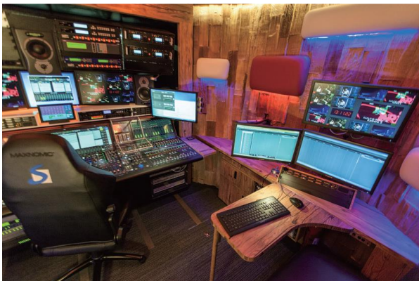
Full data coverage with two main switches.

All HD video data converges at a central station, requiring core switches to process and transfer massive data streams under high load without failure. With true physical stacking, the two SG6428X switches are linked under a single IP address, allowing them to function as one, simplifying management. If a switch crashes, the others continue operating, ensuring complete, uninterrupted data transmission across the network. This setup enhances scalability, streamlines management, increases redundancy for high-density deployments, and enables efficient network expansion for adaptability.